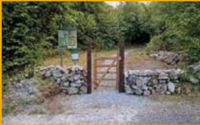
Improved signage and accessibility to Bunakippaun Woodland Trail